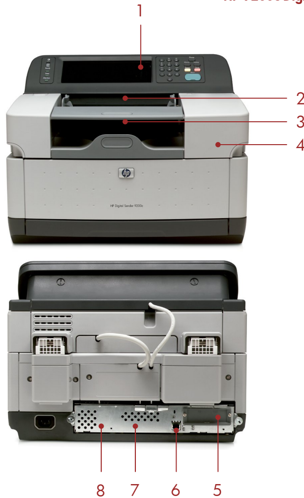
HP 9200c Digital Sender (Q5916A)